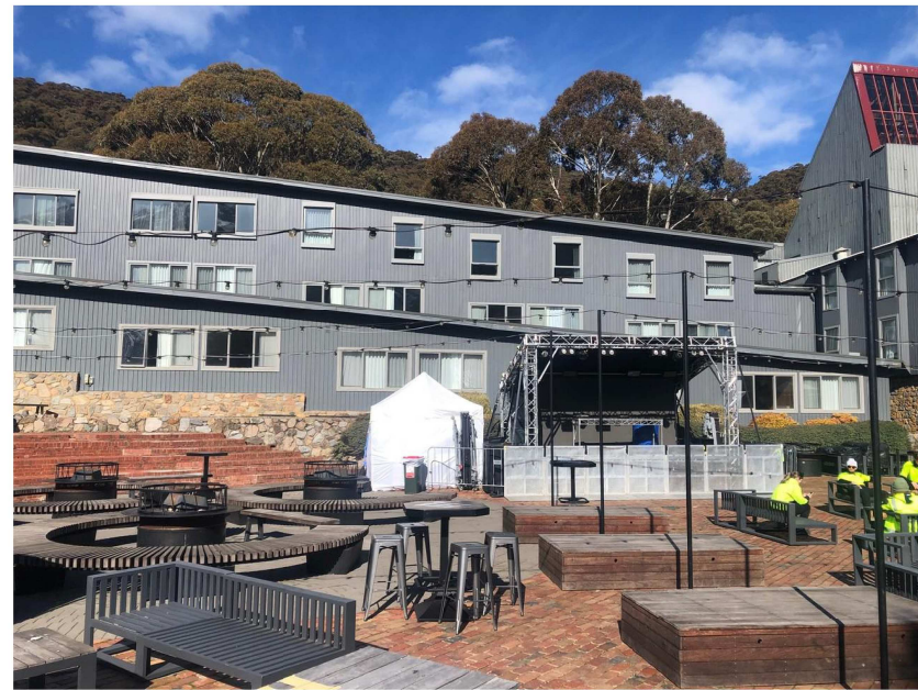
WINDOWS ON NORTHERN FACADE OF ALPINE HOTEL