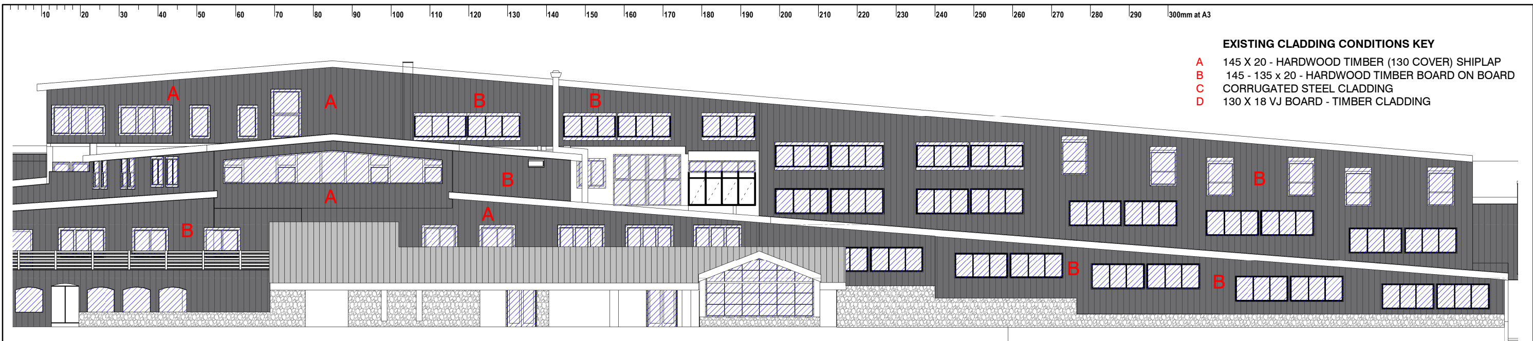
02 ELEVATION - NORTH - VIEW 2